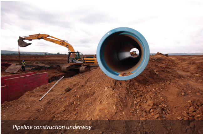
Pipeline construction underway