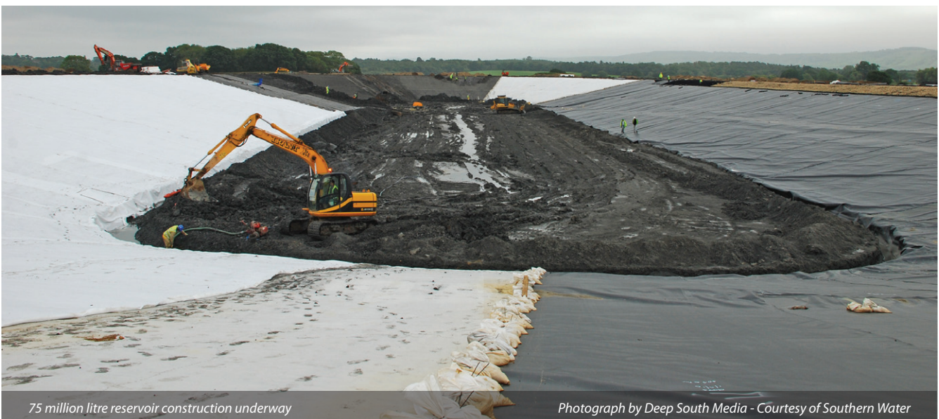
75 million litre reservoir construction underway

The preferred location of the storage pond meant the pond was constructed without having to import or export embankment materials, with on-site pumping stations and access track used for the scheme. Views of the site are extremely limited, and the top of the embankment of the storage pond has been designed to match the existing ridge line. The pond has been excavated deep into underlying clay, which reduces the required height of the embankments and means that visual and landscape impacts are minimal even from the nearest viewpoint.