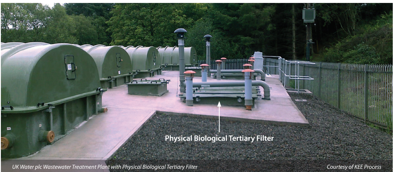
UK Water plc Wastewater Treatment Plant with Physical Biological Tertiary Filter

Most major wastewater facilities for towns and cities now include biological nutrient removal as a matter of course. With large plants, where operational resource is easier to justify, and where the plant has qualified operators with laboratory and all the operational resource, it is easier to ensure that the plant is operated within design parameters for biological nutrient removal. When the nutrient removal becomes a requirement for small plants in rural communities, the operational resources normally available at large wastewater treatment facilities become difficult to justify. The need to contain energy costs and the associated carbon footprint is top of the agenda with most clients and utility companies; therefore the rural wastewater treatment works needs to be designed to perform with minimal labour input, power consumption and other operational costs.