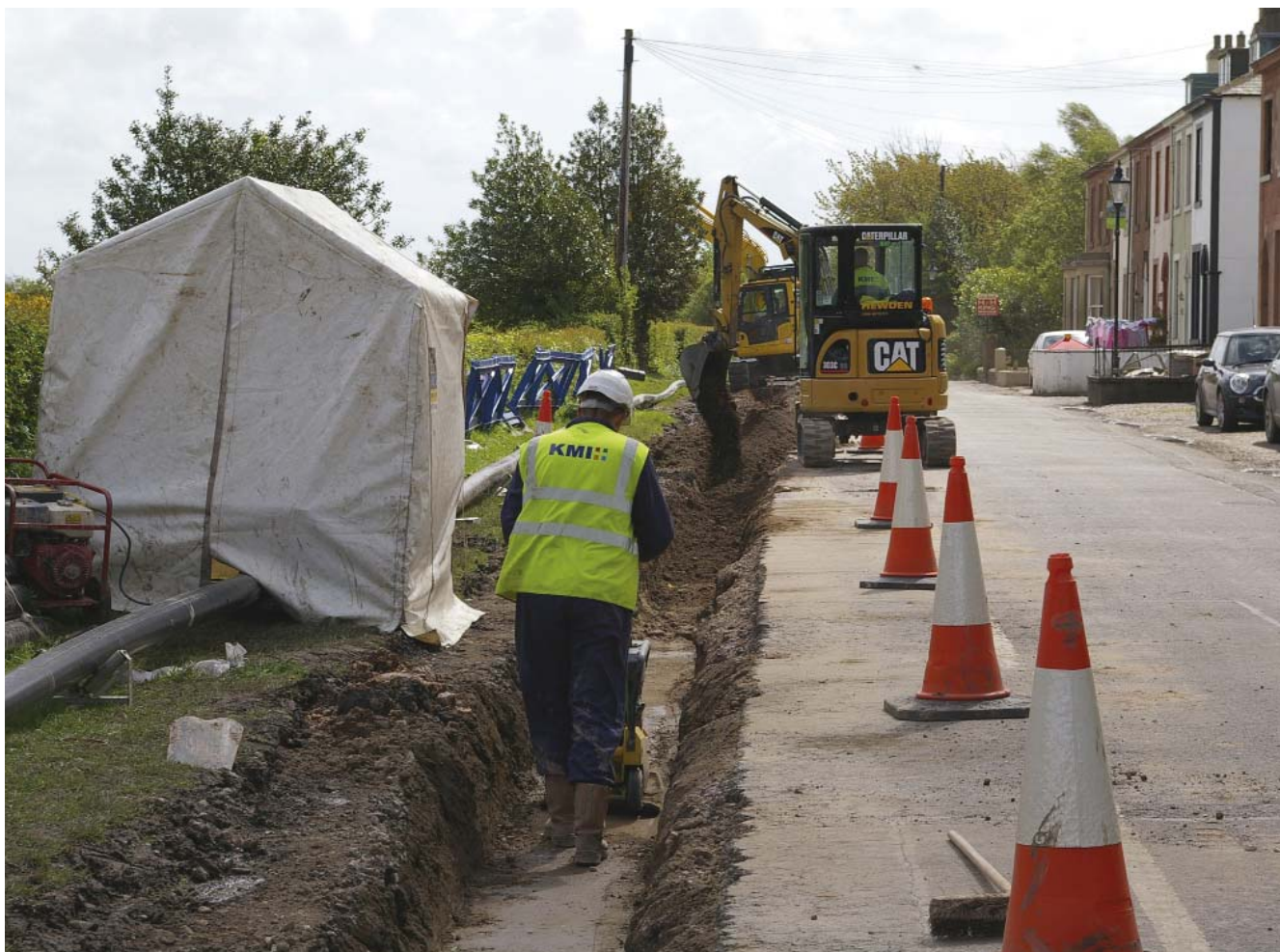
Pipeline under construction