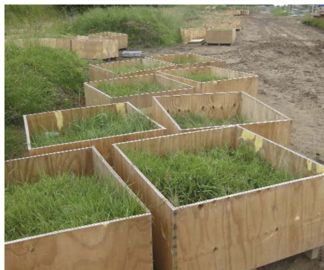
Saltmarsh turf storage

The final piece of environmental vigilance came in the form of the use of an Eco generator using bio-fuel while over-pumping at Port Carlisle Pumping Station. This ensured that if a spillage did occur into the watercourse there would be no significant damage to the unique habitat.