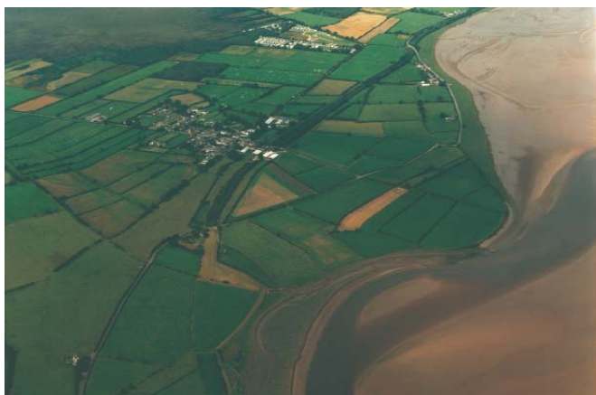
Drumborough & Glasson (L) and Port Carlisle (R)

The route of Hadrian's Wall and its associated Vallum (ditch) runs all along the Solway Coast area with the route not defined, being mainly a suggested alignment only. All sites and pipeline routes had to be designed to avoid these suggested/actual locations if possible and, where unavoidable, extensively investigated with English Heritage.