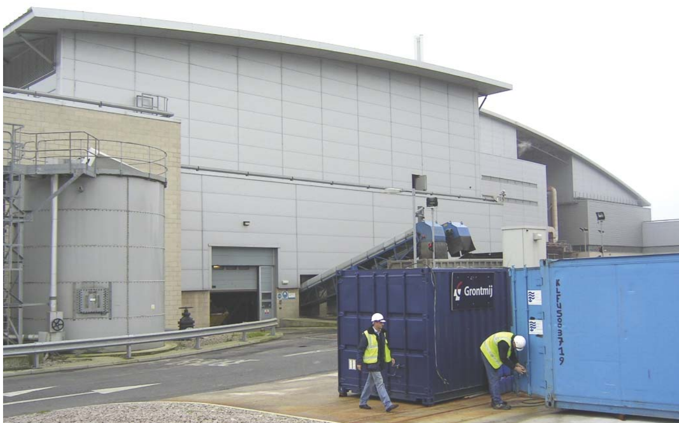
Containerised trial plant on site (2005)