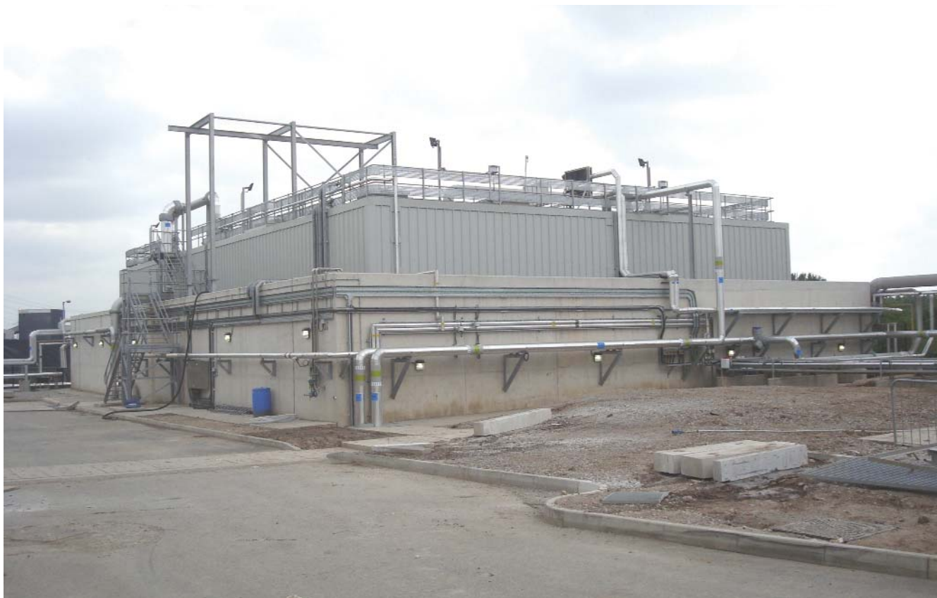
General view of completed plant within concrete bund to meet IPPC requirements (May 2010)

T he Mersey Valley Processing Centre (Shell Green) is a strategic digested sludge incineration scheme facility in Widnes on the north bank of the River Mersey. The centre is critical to the safe and efficient disposal of waste water sludge from the Manchester and Liverpool conurbations and was originally constructed in the 1990's. The new Shell Green (Stream 3) extension provides United Utilities with additional capacity by the construction of a new sludge dewatering facility and a third sludge incineration stream. The existing facility receives approximately 65,000 tDS per year of sludge. The Stream 3 extension increases capacity to nearly 90,000 tDS per year serving a population of approximately 4 million.