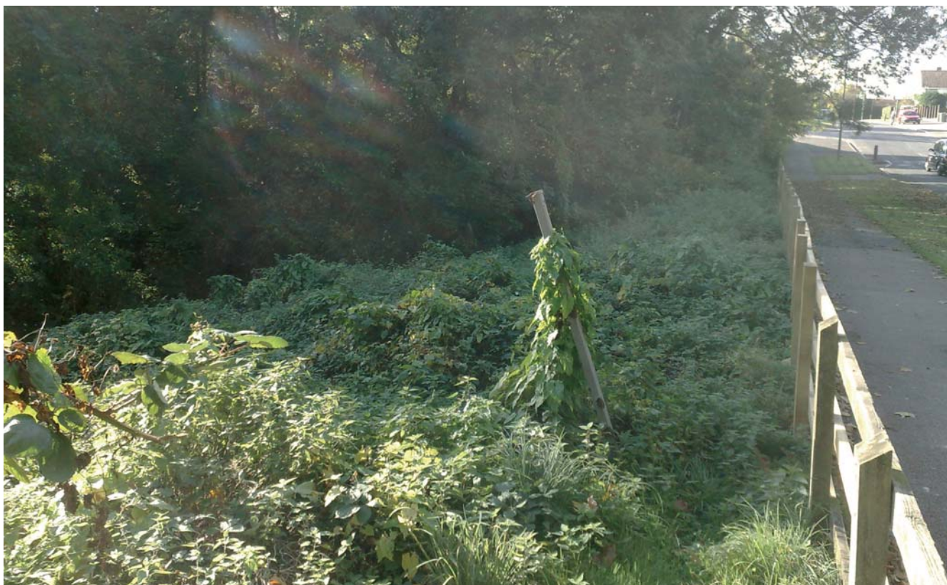
Woolley Road Land Reserve – Future SUDS Site