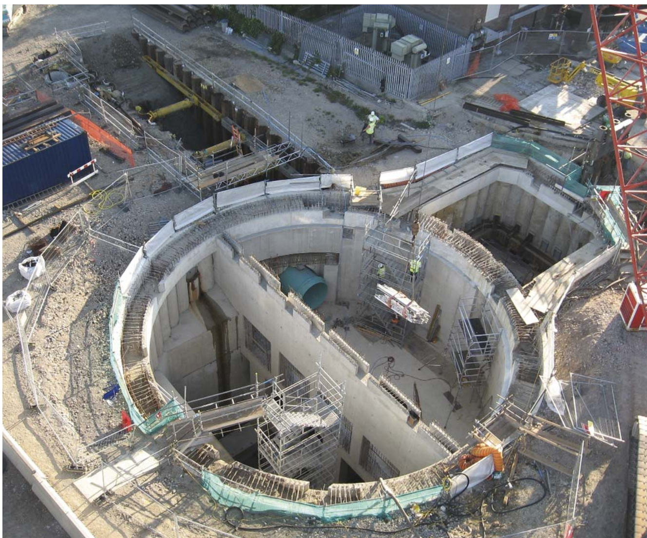
Aerial view of the shaft during construction

S outhern Water's storm pumping station at Eastney, Portsmouth, has been in operation since 1868. The James Watt & Co. beam engine pumps of 1887, housed in the original Victorian engine house, were replaced with diesel engine-powered pumps in 1954 but preserved as museum pieces. In recent years, with the increasing frequency and intensity of storm events, flooding has become a growing threat in Portsmouth, where large areas of the city are below sea level. In 2007, Southern Water announced a £20m ten-point plan to provide the city with greater protection from flooding. The plan included constructing an underground pumping station in Bransbury Park, Eastney, to pump stormwater and sewage to nearby storage tanks, providing a vitally needed back-up to the existing station.