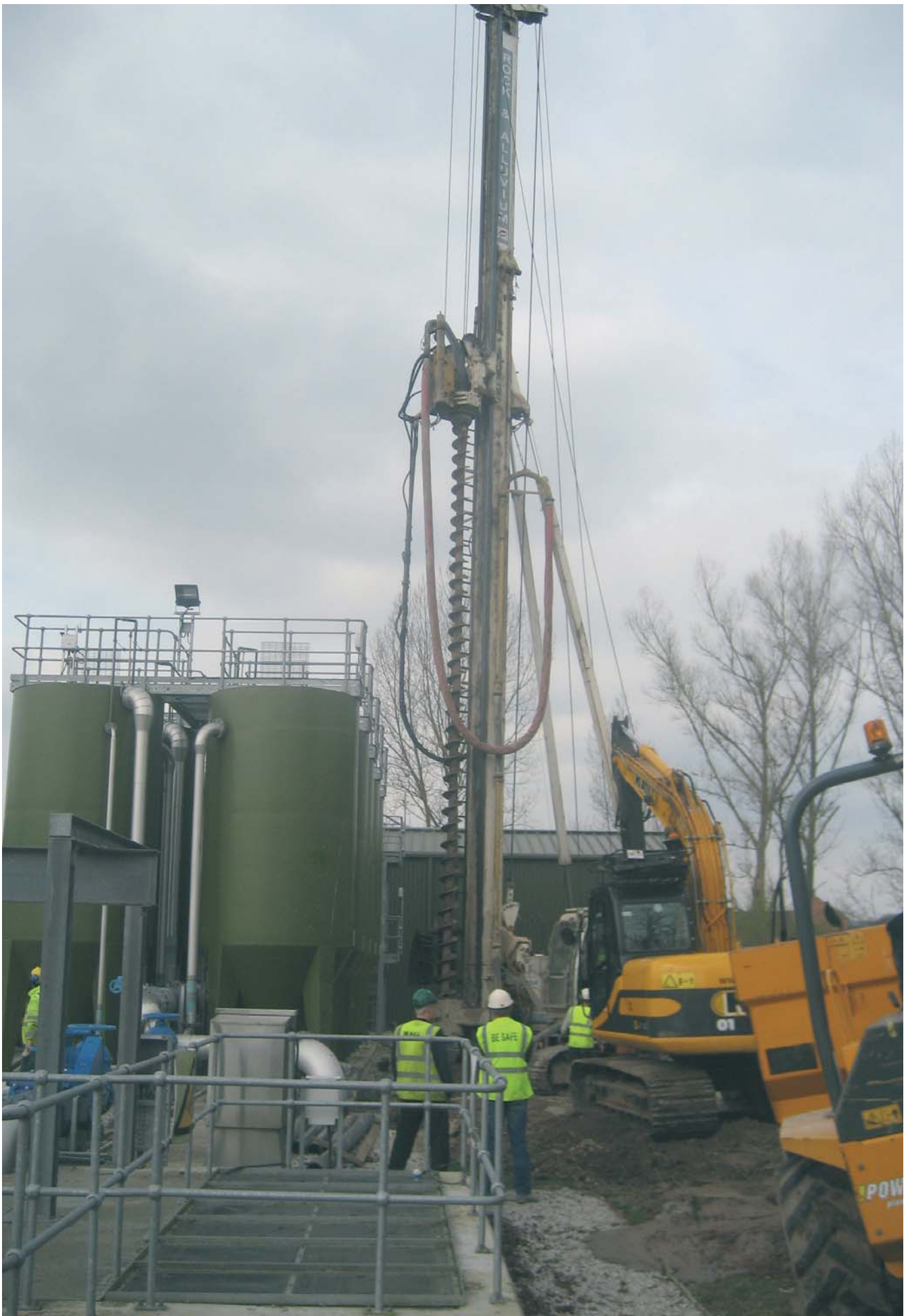
CFA Piling for new NSF foundations (existing 10 COUF units, two banks of 5 in picture)