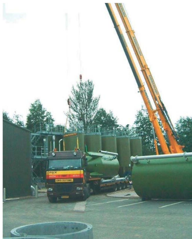
Lifting a new NSF unit into place on the far side of the existing 10 COUF units (left) and offloading 2 new NSF units adjacent to existing 10 COUF units (right)