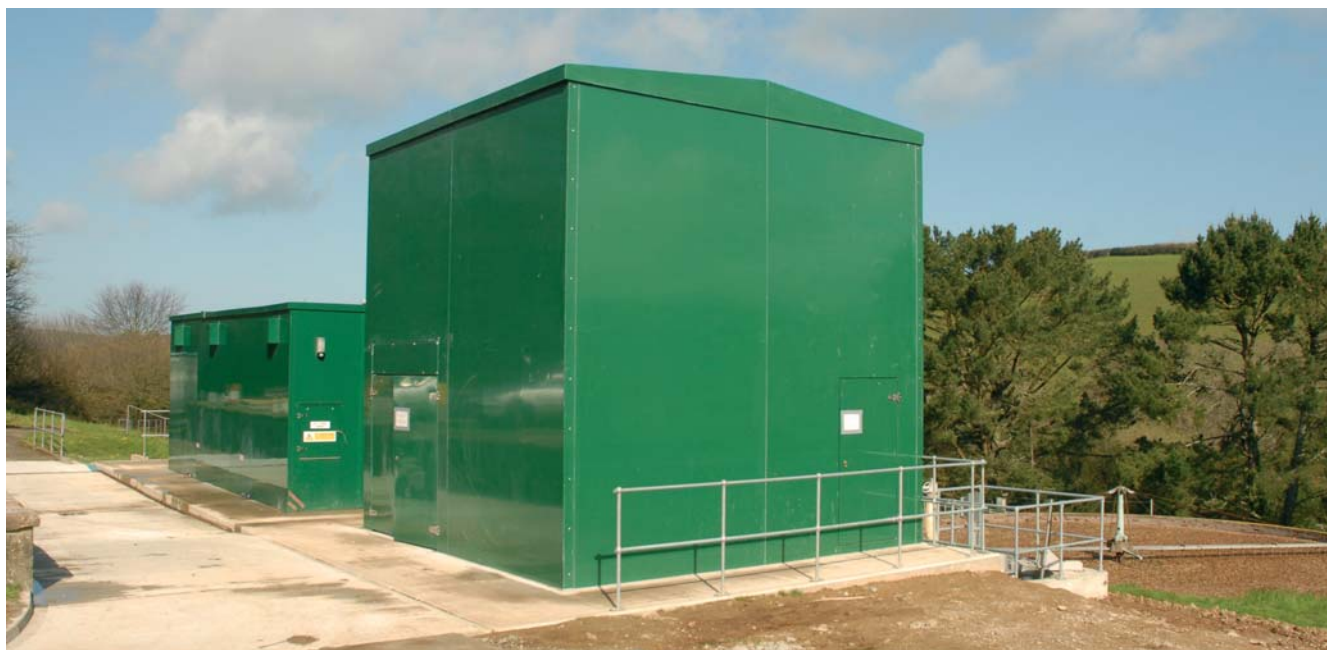
Metal salts & alkalinity dosing kiosks at Scarletts Well in Bodmin