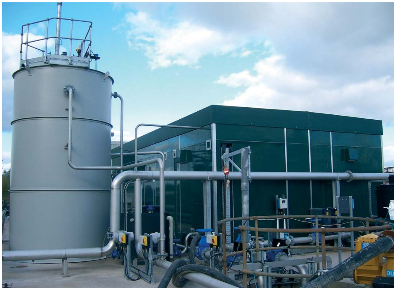
Avonmouth (St Modwen) Effluent treatment plant - Actiflo® clarification system

T he objective of this project relates to the establishment of new effluent treatment facilities at an old St Modwen industrial site (Britannia Zinc Ltd), at Avonmouth industrial estate near Bristol. The new treatment facilities, which effectively replace the old treatment plant, are required to provide satisfactory treatment of the current and future flows of contaminated waste water arising on the site prior to their discharge to a local estuary. The old ETP will then be demolished.