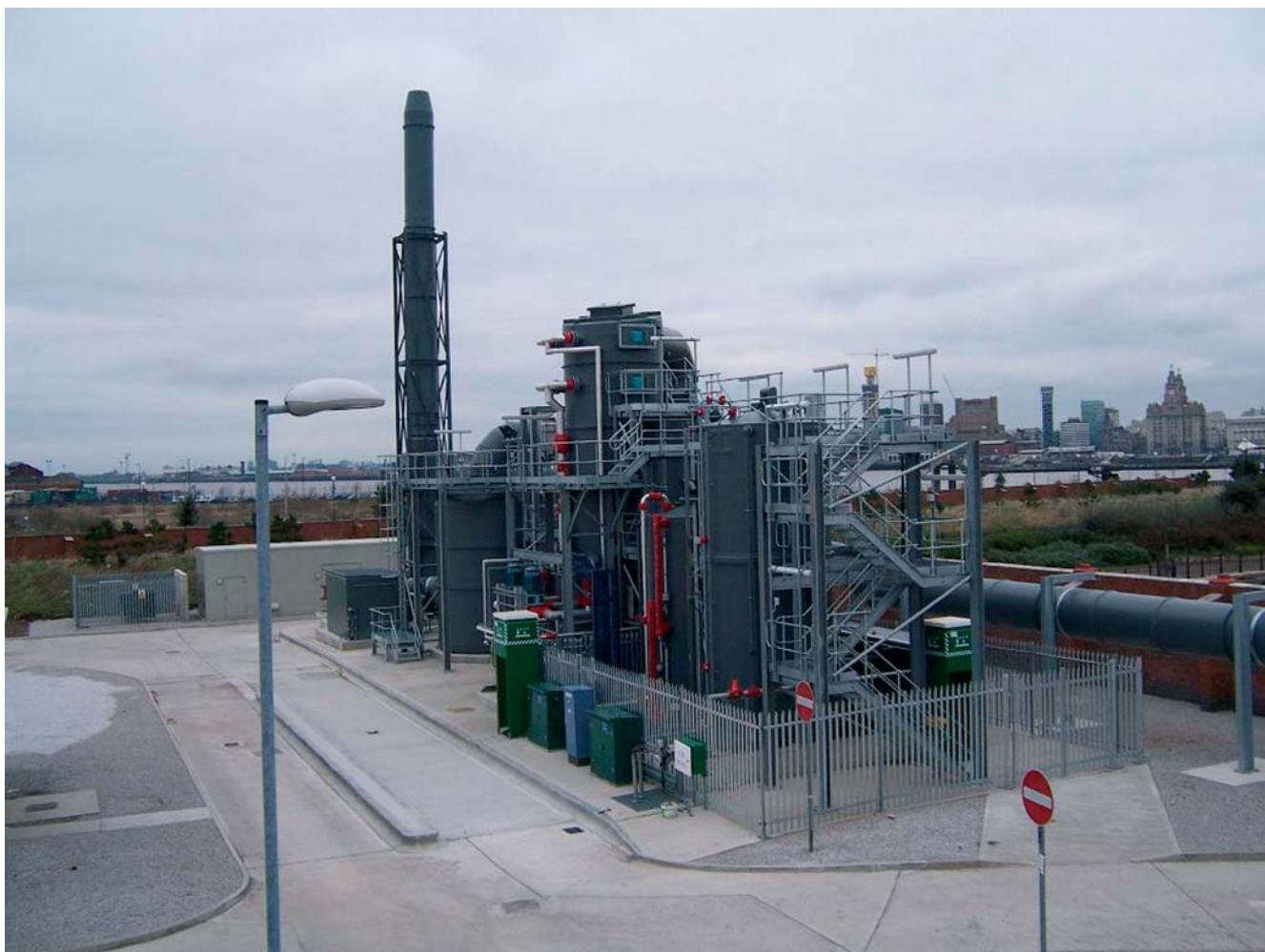
Completed Odour Control Plant at Birkenhead WwTW