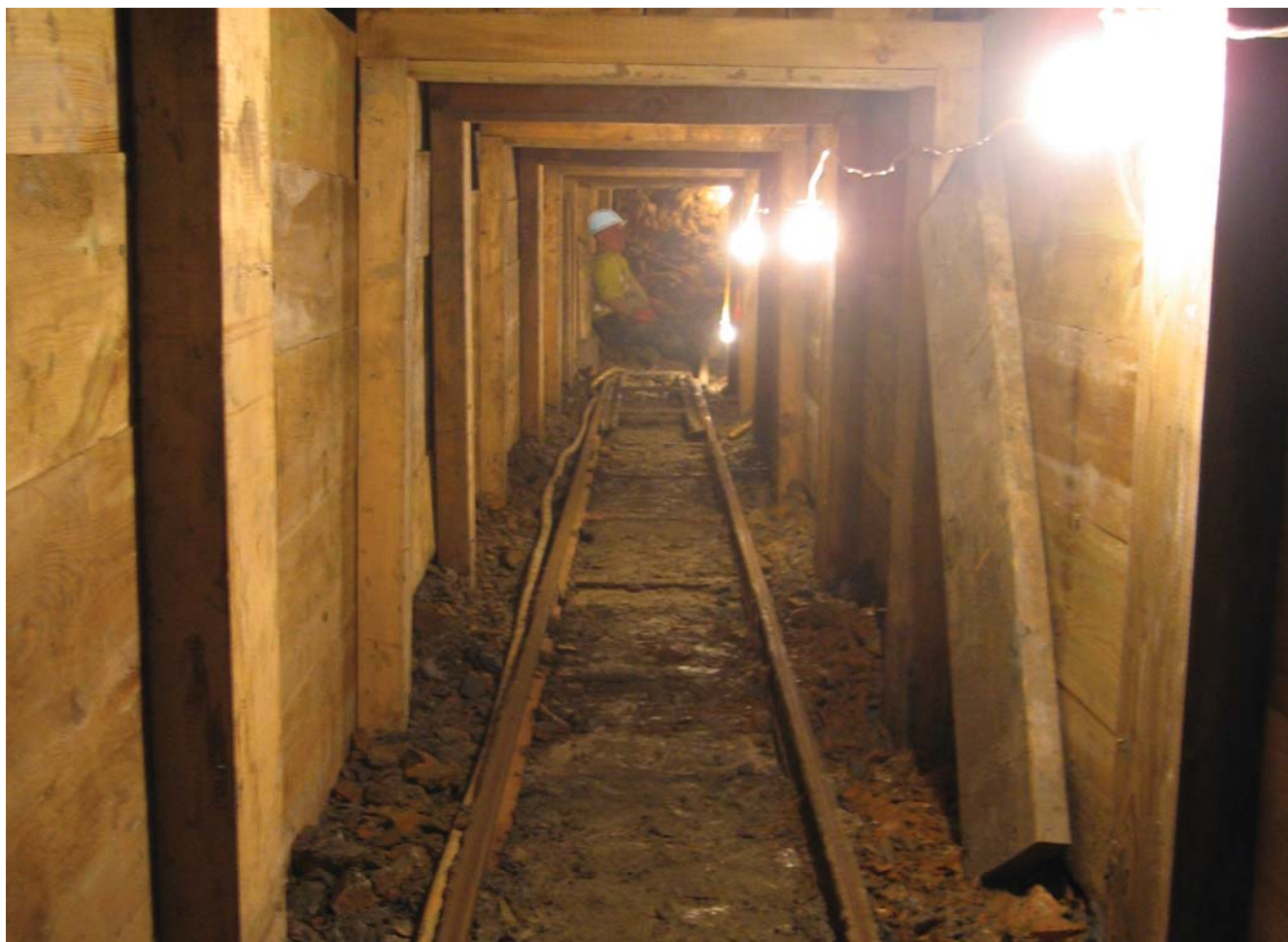
Weald Road - Timber heading works in progress

B urgess Hill is a town in West Sussex, located 10 miles north of Brighton. In the 1950s the picturesque former parish - which contains two nature reserves - underwent a period of rapid expansion, earning it the temporary title of the 'fastest growing town in South East England'. At the last census Burgess Hill had a population of more than 28,000. However, the peaceful idyll was shattered last year when several properties reported extensive foul flooding to Southern Water. The foul flooding was first reported in February 2006, following a period of wet weather, when driveways and gardens of houses at the low lying end of Poveys Close suffered severe sewerage inundation due to the surcharging of the local sewer network. In some cases the effluent entered properties through air bricks and there was concern that the flooding would threaten a neighbouring junior school, a local pond and a natural water course. Southern Water quickly responded by carrying out an investigation, anticipating the cause to be a simple blocked sewer. However, when jetting of the local sewer pipe resulted in damage to one of the Supa-Sucka rigs, all the evidence pointed to a more serious cause of the flooding.