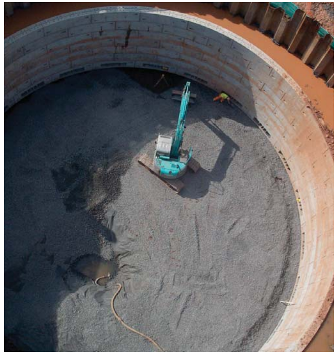
25m diameter tank at Taunton Road, under construction 2004

The work was completed in time for the March 2005 regulatory date and the project was a great success due to the following factors: