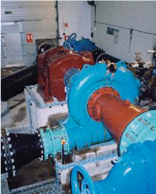
Littlehempston: Francis Turbine

S outh West Water Asset Management & Development project team have recently completed building of the Company's eighth hydro power station into its portfolio of green energy production units. This hydro power station is somewhat different from its predecessors as it is positioned at the inlet to one of its strategic water treatment works. An environmental methodology was used throughout the life cycle of the scheme utilising industry best practices.