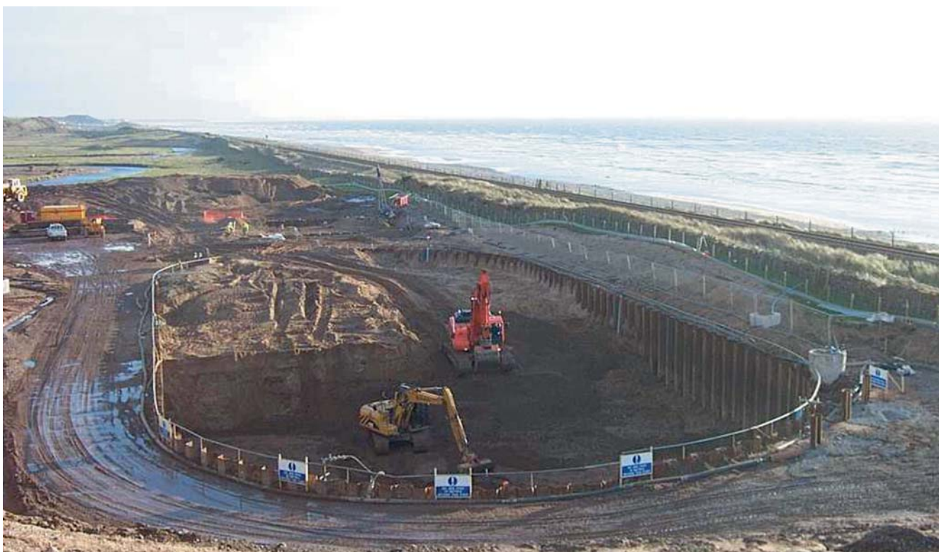
Braystones WwTW under construction

B raystones WwTW scheme, located in West Cumbria, incorporates the construction of a greenfield sewage treatment works, as a result of the EU Urban Waste Water Treatment Directive, and will treat wastewater from the villages of Egremont, St Bees, Nethertown, Thornhill, Beckermest and Braystones. At present sewage from these villages is discharged to sea with little or no treatment, with St Bees being the exception and receiving full treatment. The project consists of modification of the St Bees WwTW and construction of three new off site pumping stations. A new transfer main is to be constructed which will connect the pumping stations from Nethertown and St Bees and carry all of the sewage to a new works at Braystones.