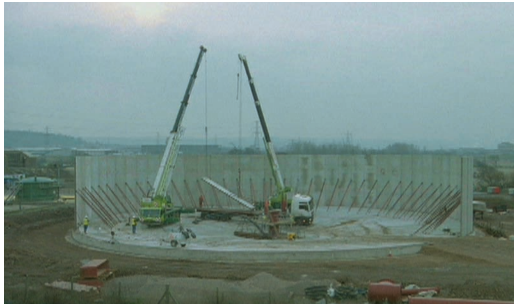
Midway through construction 10/12/02.