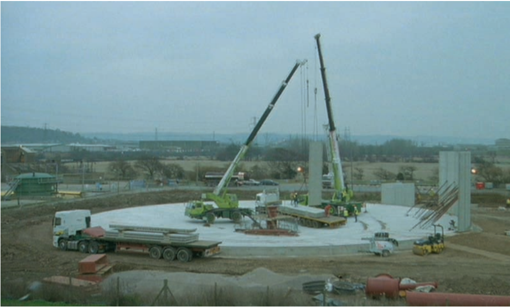
Photo shows start of construction 9/12/02.