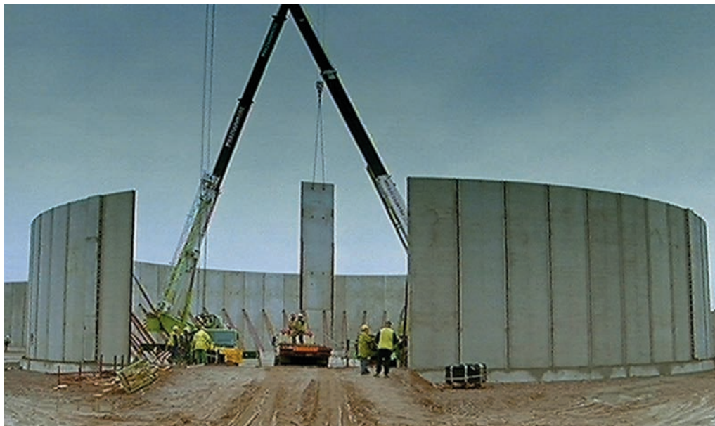
Final wall installation 12/12/02 (Time lapse photography by John Adderley, courtesy MJ Gleeson).