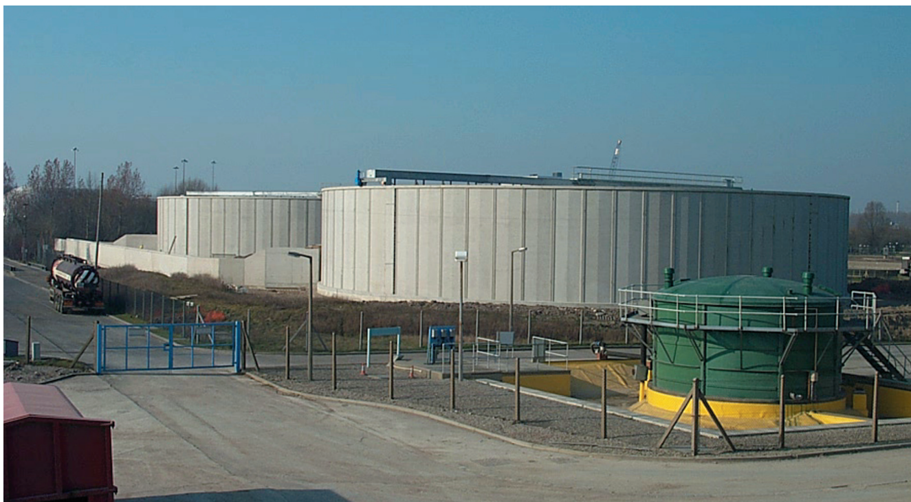
Completed tank 45m in diameter and 8m high.

B ristol Waste Water Treatment Works, situated on 46.5 hectares of marshland reclaimed from the Severn Estuary at Avonmouth, is Wessex Water's largest plant. It serves the Bristol area which has a population equivalent of approximately one million. Part of the Company's current AMP3 quality output is the provision of storm tank storage at the site. An alternative to conventional reinforced concrete construction has been employed on the storm tanks to not only provide a cost-effective solution but to maintain the tight construction programme.